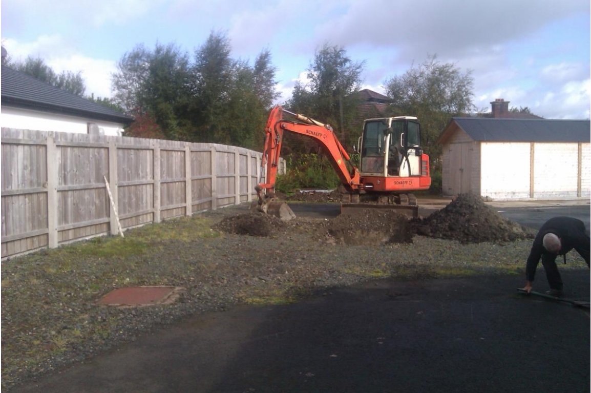
Plate 3: General view of application site during evaluation, looking east