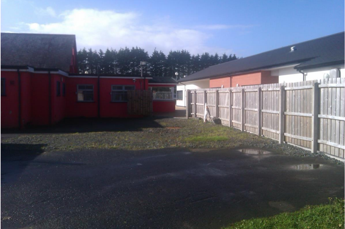
Plate 1: General view of application site, looking north-west