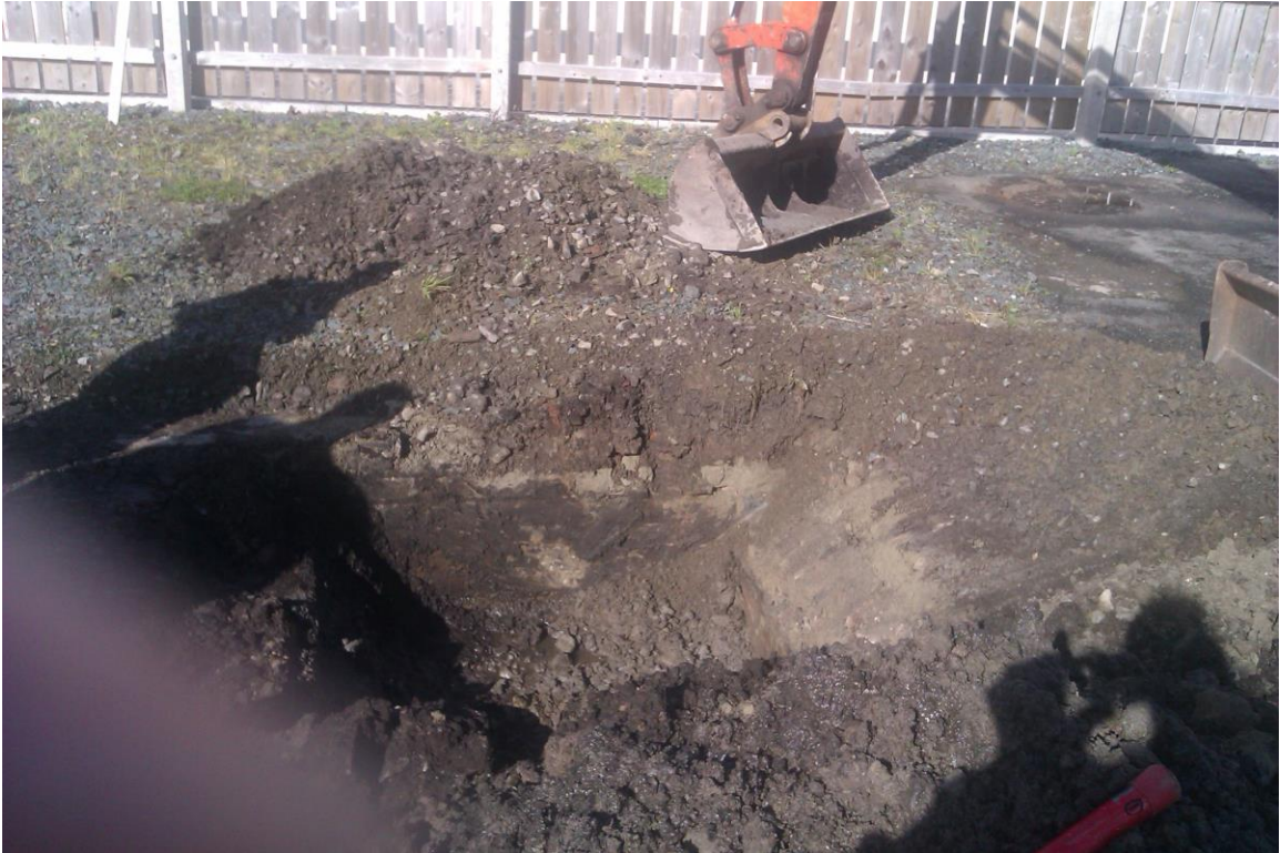
Plate 6: Walls in Trench 2 (C203 & 204, looking north