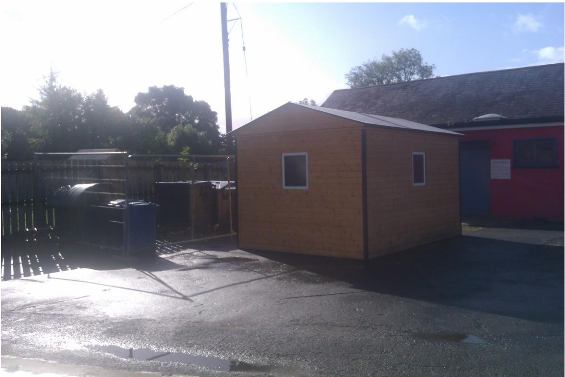
Plate 2: General view of application site, looking south