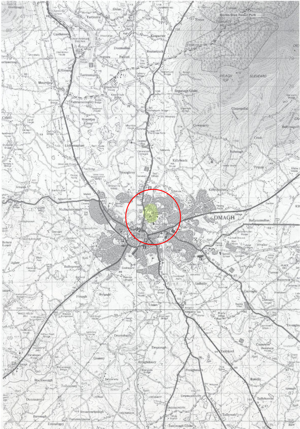
Figure 1: Map showing the location of the site (circled in red)