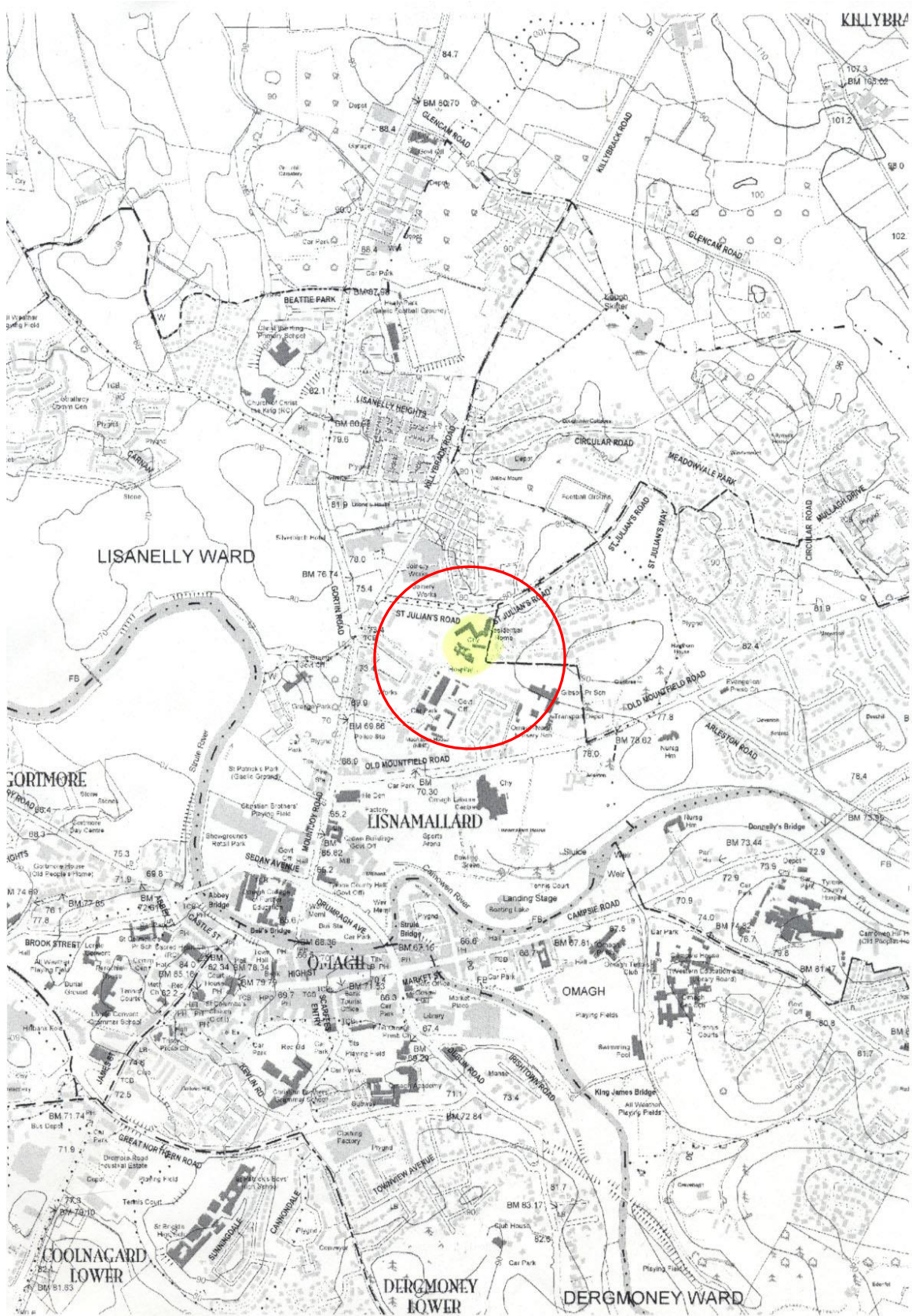
Figure 2: Detailed map showing the location of the site (circled in red)