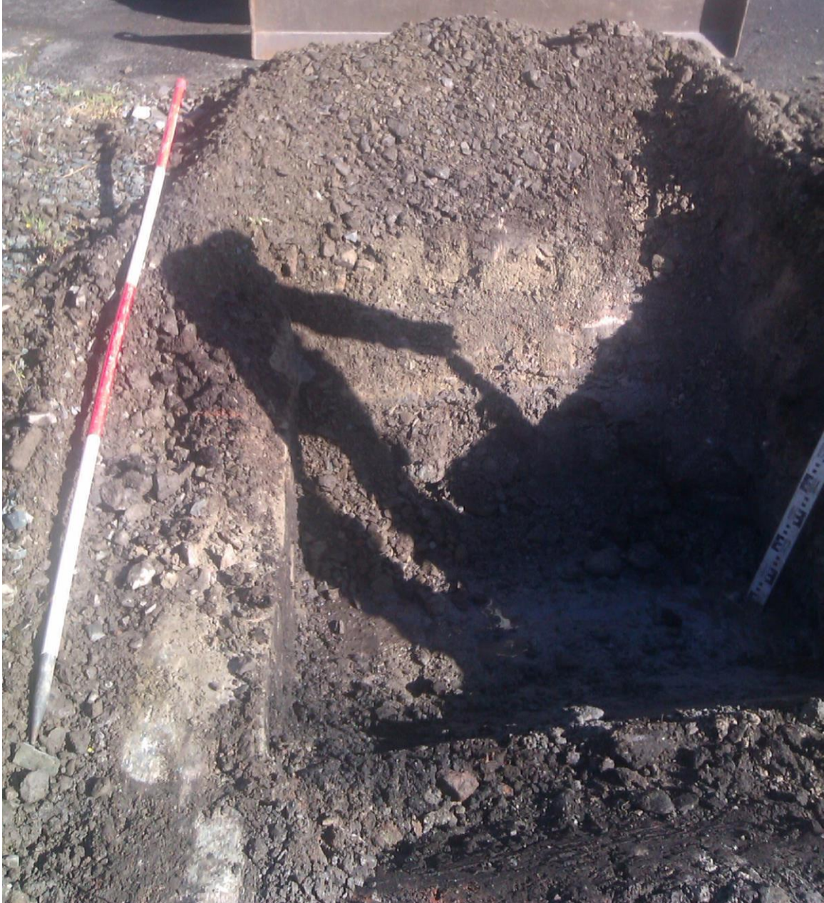
Plate 5: Walls in Trench 2 (C203 & 204), looking east