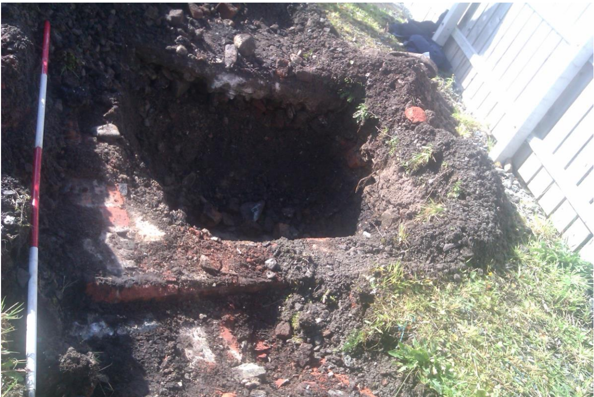
Plate 4: Brick foundations in Trench 1 (C104), looking west