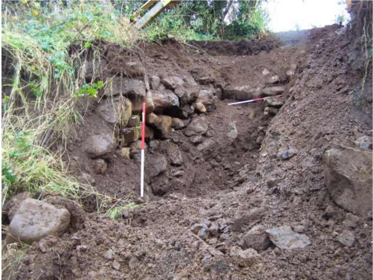
Photo 2: Souterrain passage after excavation showing surviving east wall.