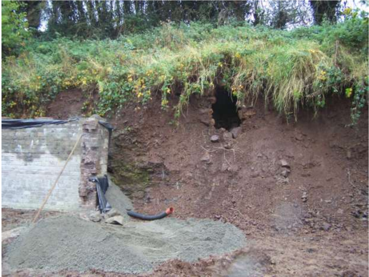
Photo 1: Photograph of the souterrain fragment from the south prior to excavation.