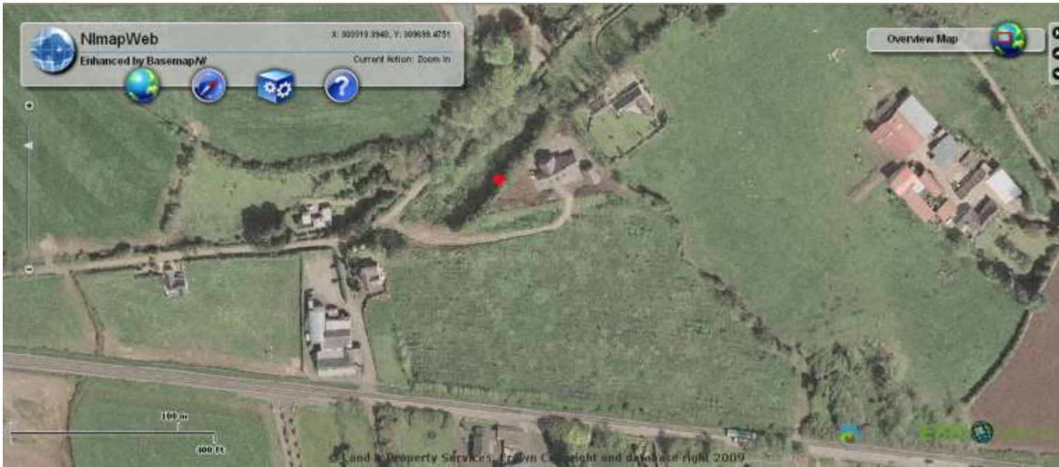
Figure 3: Aerial photograph of Moneynick, Co. Antrim showing location of souterrain (red square)