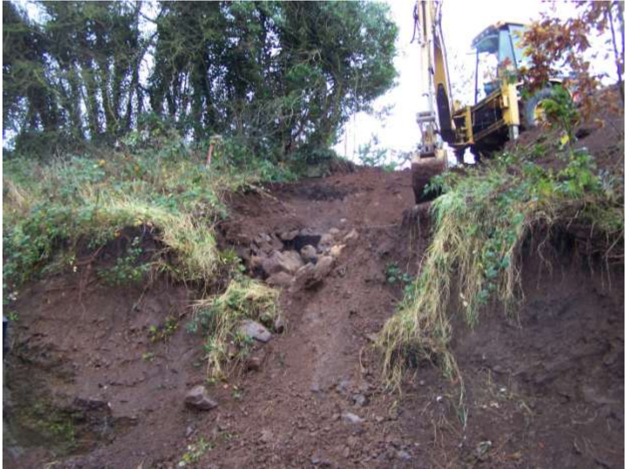
Photo 4: Photo of excavation showing difficult working position of mechanical excavator.