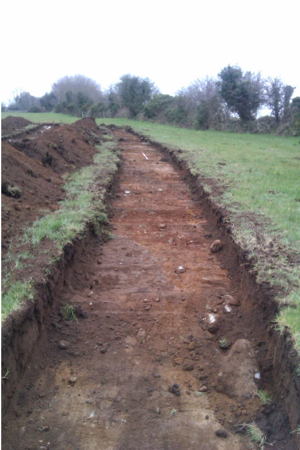
Plate 9: Trench 3 following excavation to subsoil level, looking north