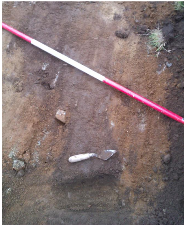
Plate 13: Section through linear feature (C306/307), looking north