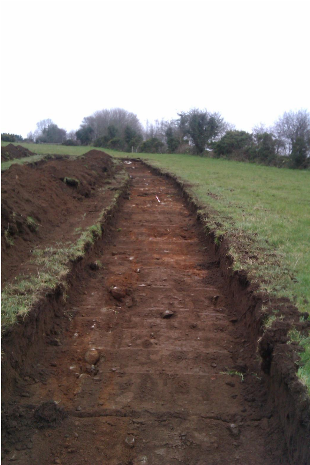
Plate 6: Trench 2 following excavation to subsoil level, looking north