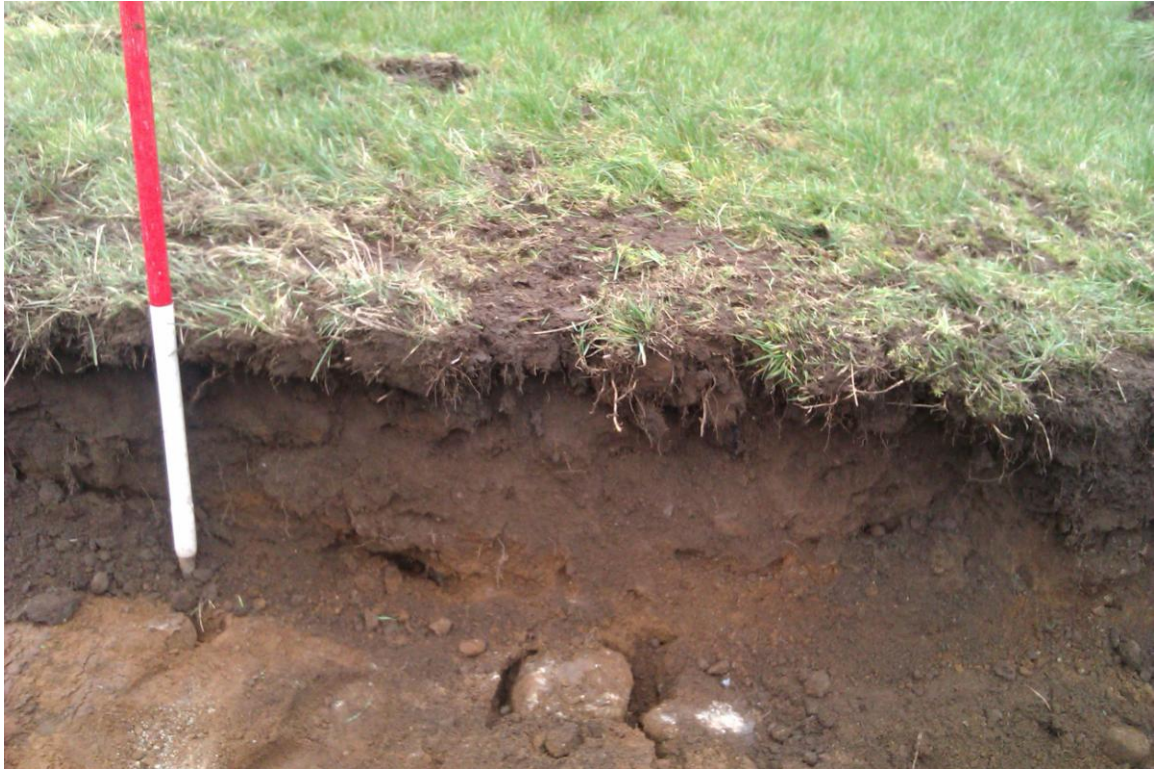
Plate 10: Part of west-facing section of Trench 3, looking east