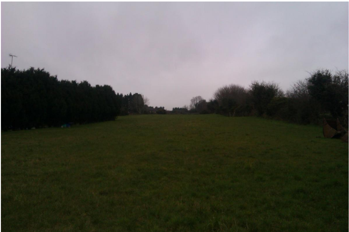
Plate 2: General view of the site prior to the evaluation, looking north