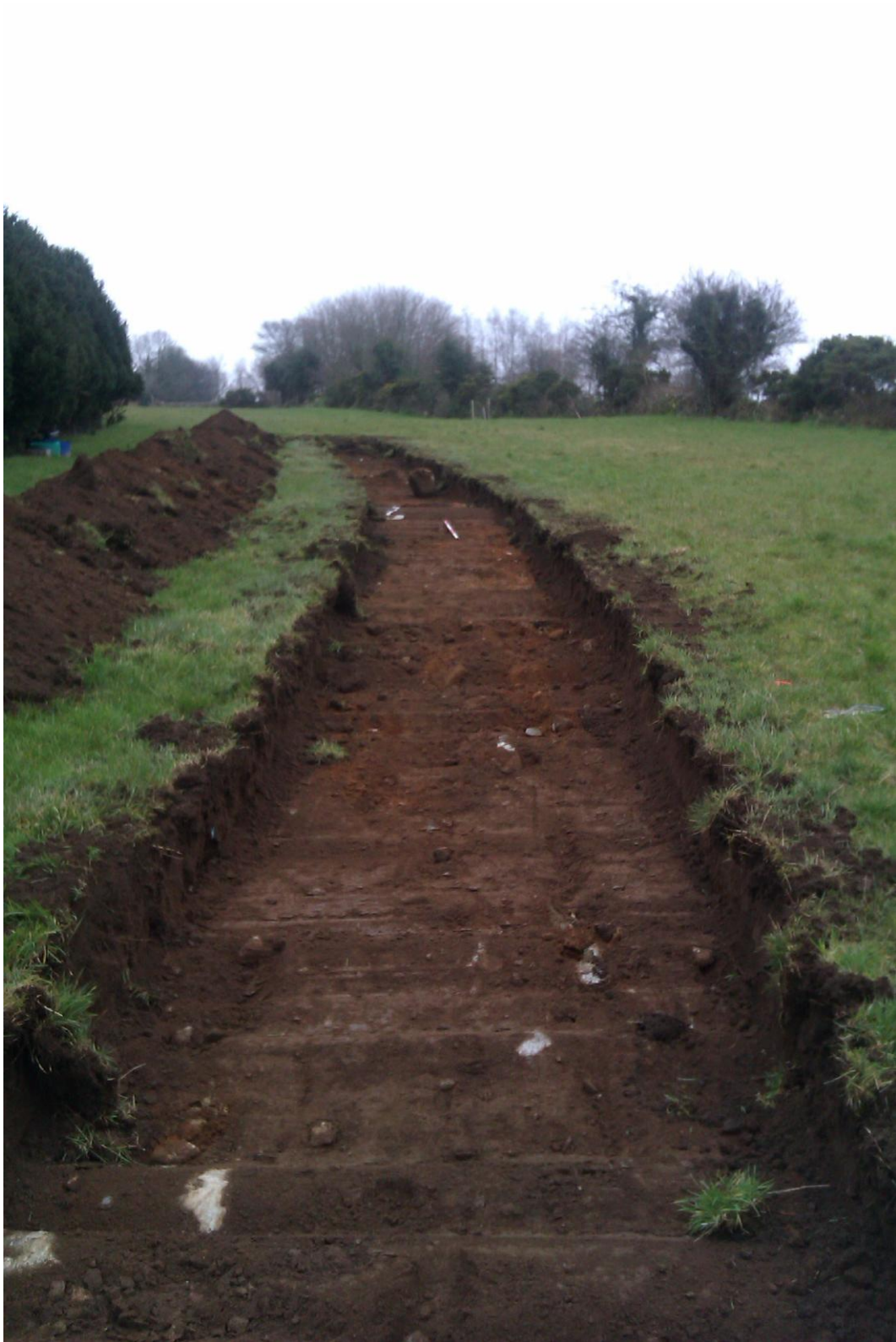
Plate 4: Trench 1 following excavation to subsoil level, looking north