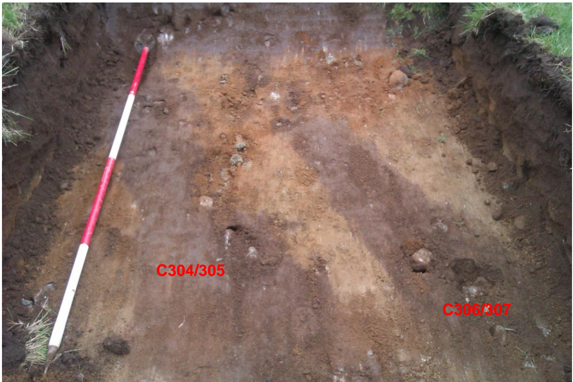
Plate 11: Linear features (C304/305: left & C306/307: right) in Trench 3, looking south