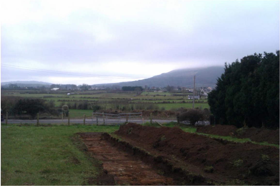
Plate 1: General view of the site midway through the evaluation, looking south