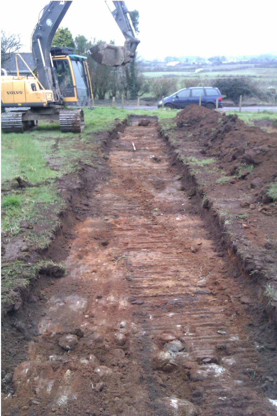
Plate 14: Trench 4 following excavation to subsoil level, looking south