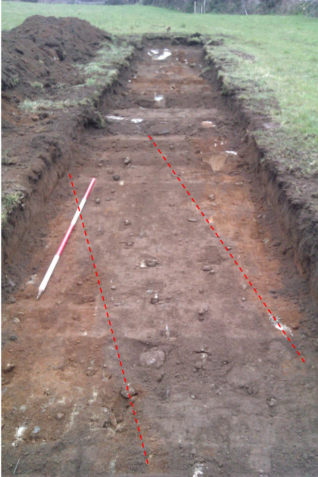
Plate 8: Linear feature in Trench 2 (C204/205), looking south