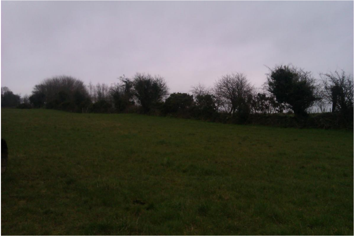
Plate 3: General view of the site prior to the evaluation, looking north-east