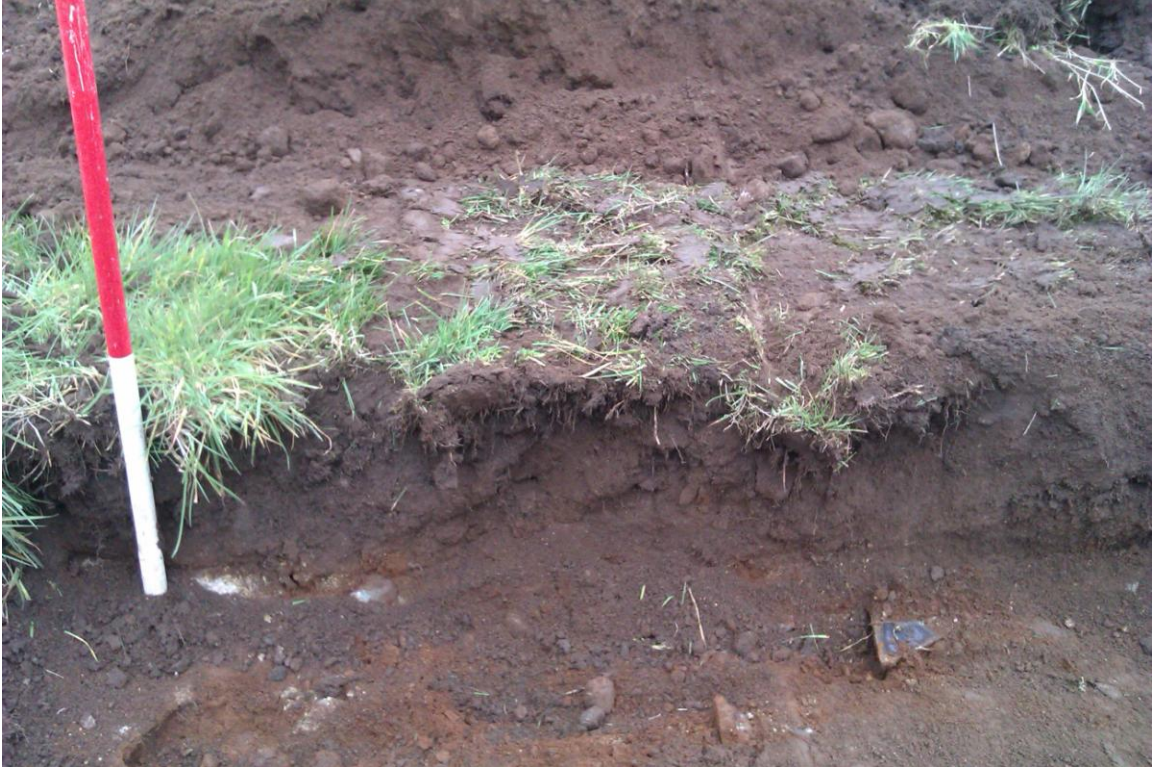
Plate 15: Part of east-facing section of Trench 4, looking west