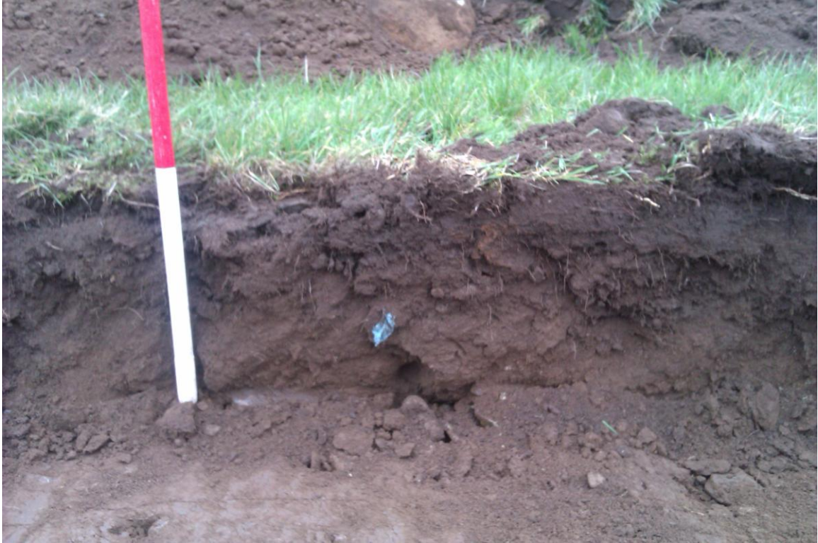
Plate 5: Part of east-facing section in Trench 1, looking west