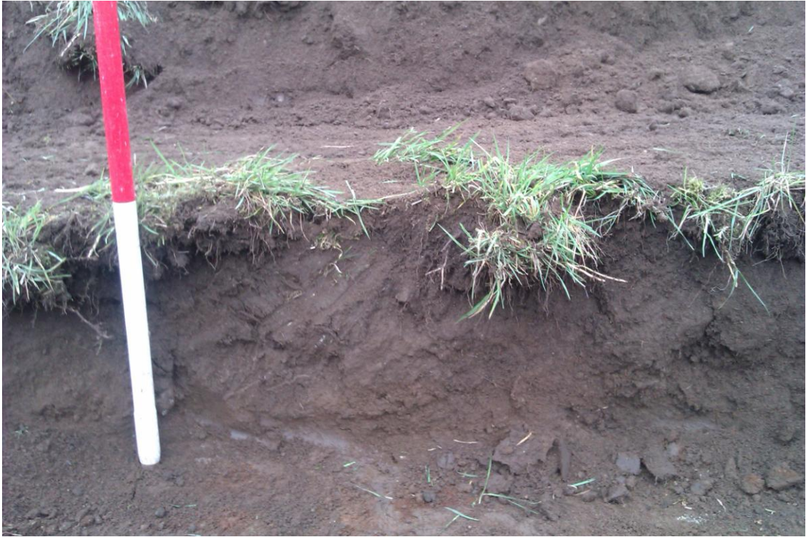
Plate 7: Part of east-facing section of Trench 2, looking west