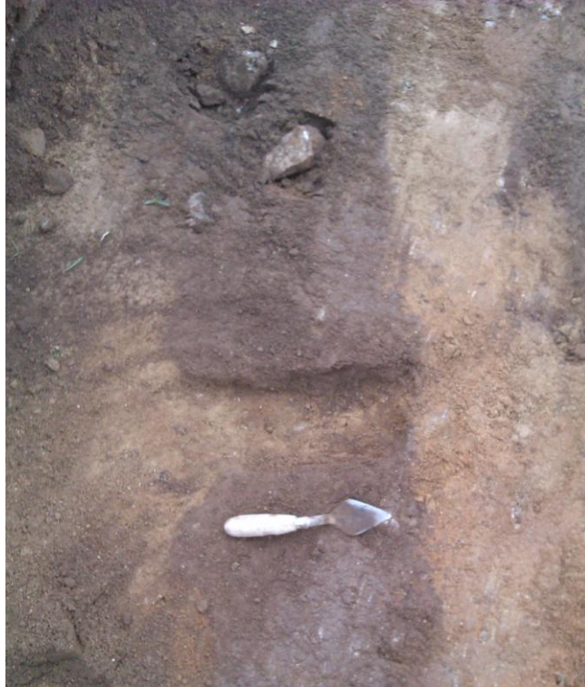
Plate 12: Section through linear feature (C304/305), looking north