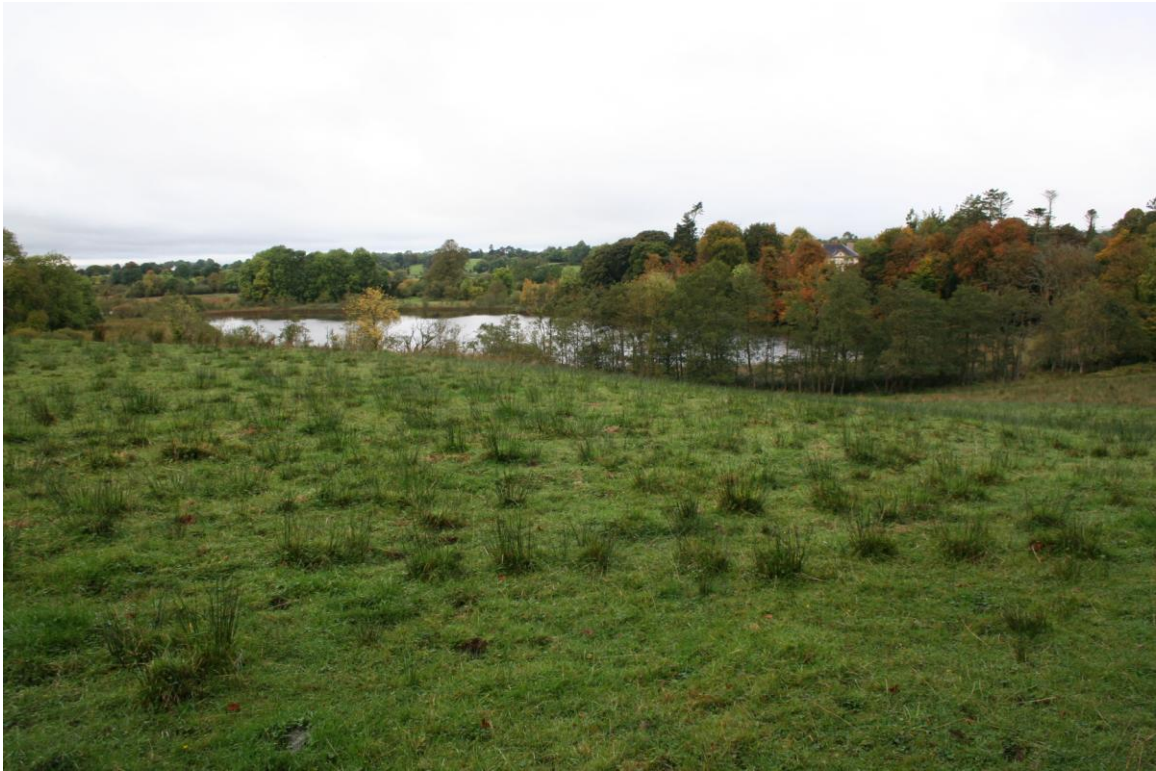
Plate One: View of the development site prior to the evaluation, looking north-west.