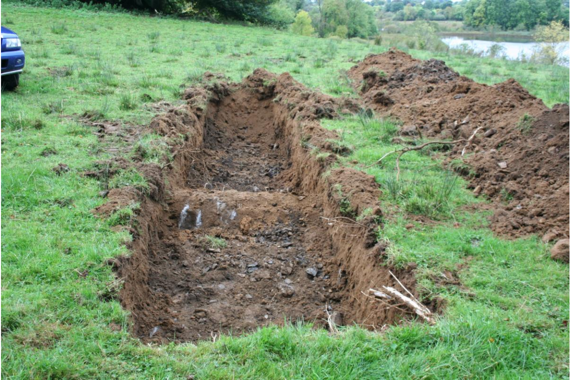
Plate Three: Trench Two following excavation to the surface of the natural subsoil (Context No. 203), looking west. The large boulder that protruded the subsoil can be seen about the centre of the trench.