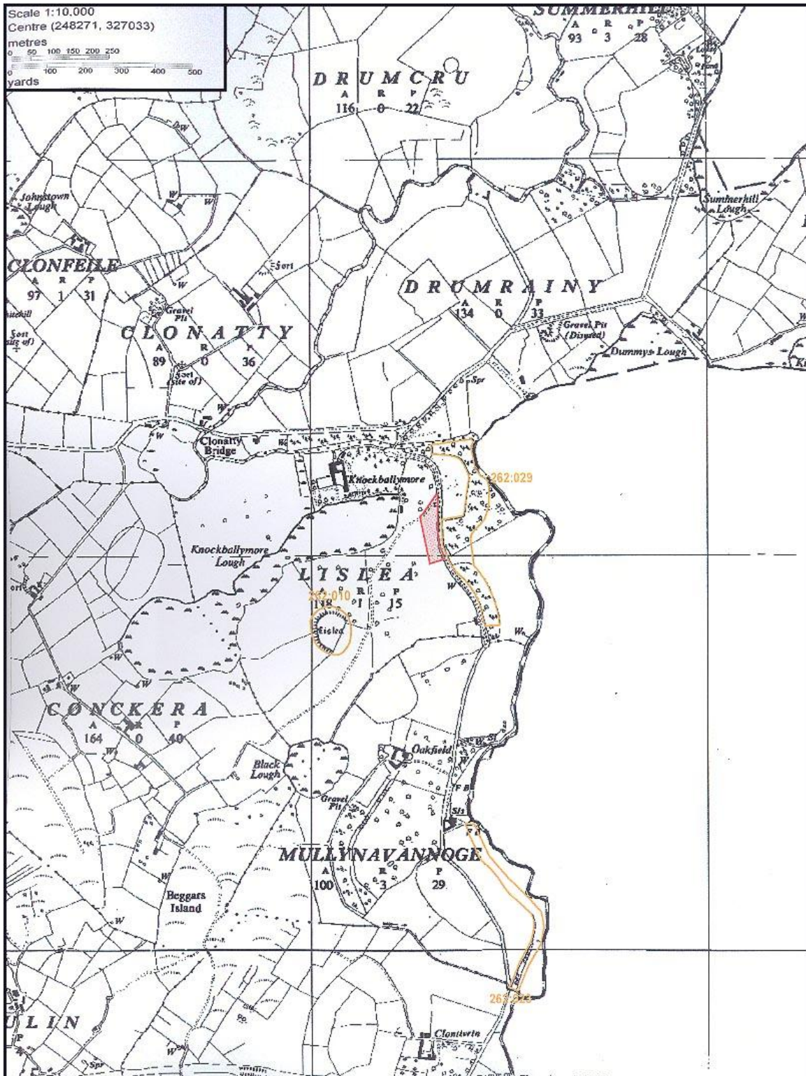
Figure Two: Map showing the development site (in red) in relation to the Black Pig's Dyke and a rath (both shown in yellow).