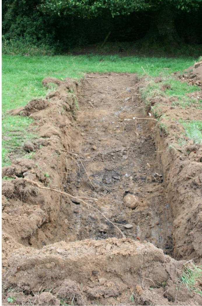
Plate Two: Trench One following excavation to the surface of the natural subsoil (Context No. 103), looking east.