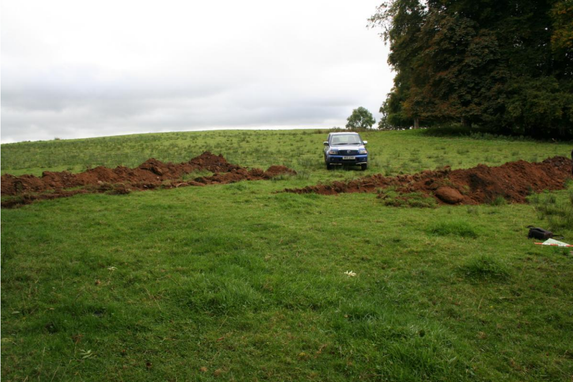
Plate Four: View of the development site showing Trenches One and Two following the evaluation, looking south-west.