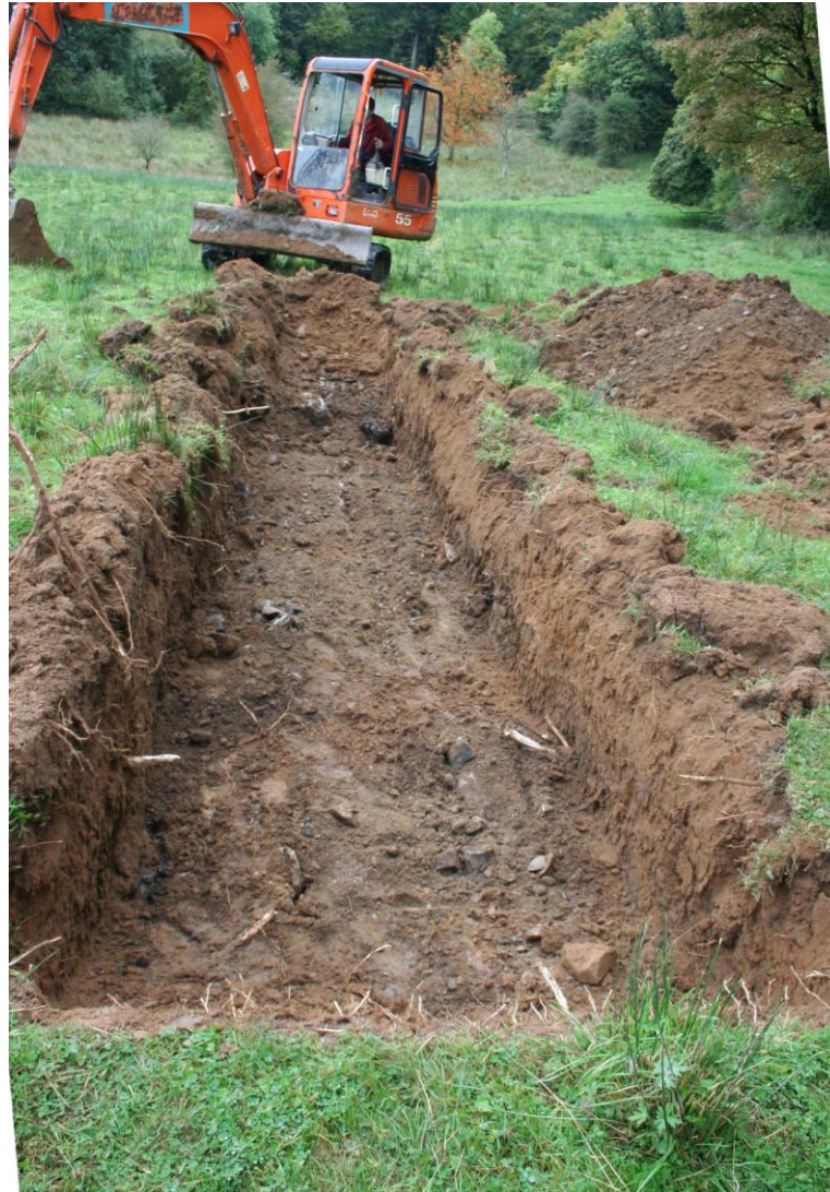
Plate Four: Trench Three following excavation to the surface of the natural subsoil (Context No. 302), looking north.