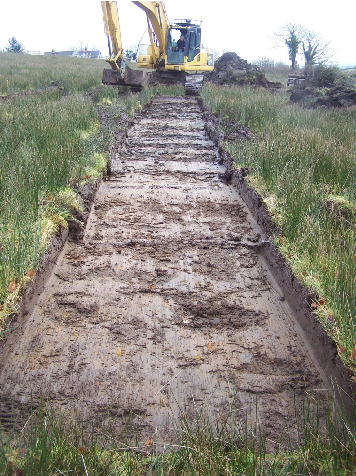
Plate 2: Trench Two following excavation to the surface of the natural subsoil (Context No. 202), looking east.