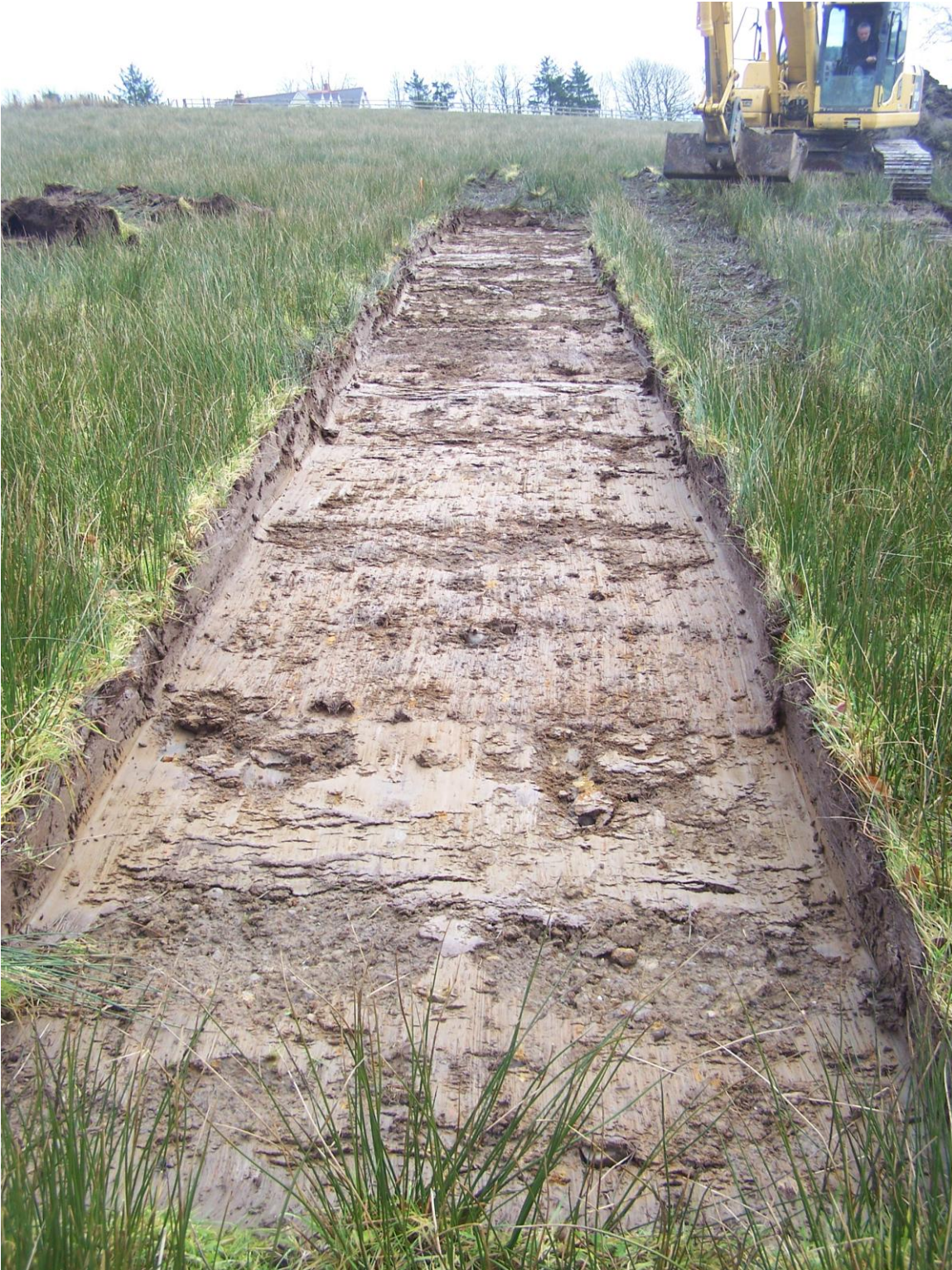
Plate 1: Trench One following excavation to the surface of the natural subsoil (Context No. 102) looking east..