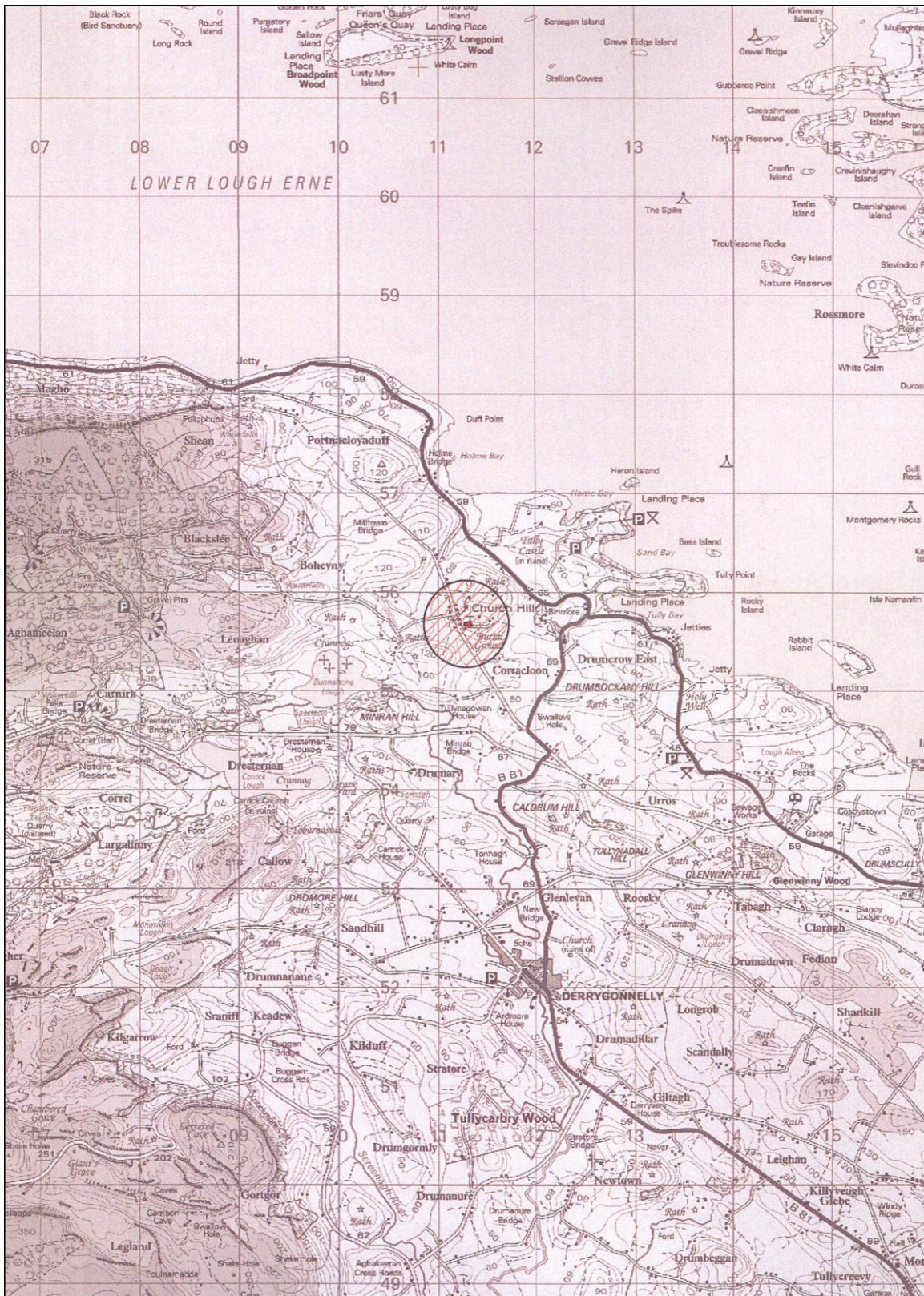
Fig. 1: General location map showing Church Hill (circled).