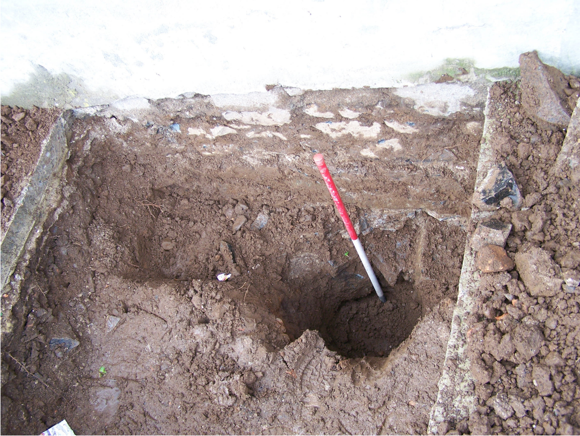
Plate Two: Excavation of Test Pit 2 along the southern wall of the Market Yard. The base of the foundations are visible, looking south.