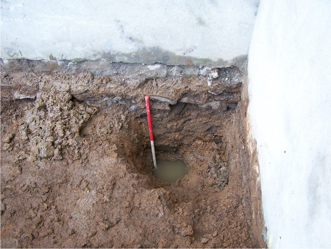
Plate Four: Excavation of Test Pit 4 in the north-eastern corner of the Market Yard. The base of the foundations of the wall can be seen.