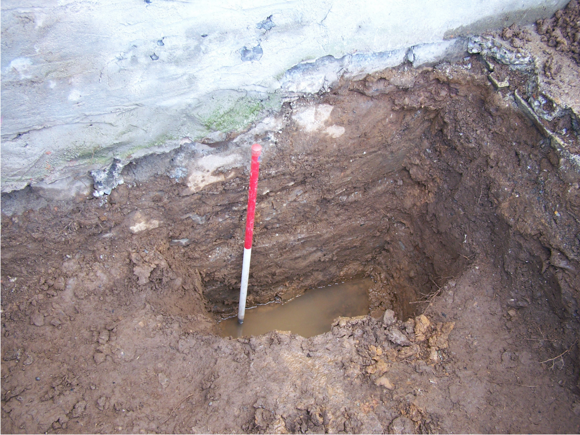
Plate Three: Excavation of Test Pit 3 in the south-eastern area of the Market Yard. The base of the foundations are visible, looking east.