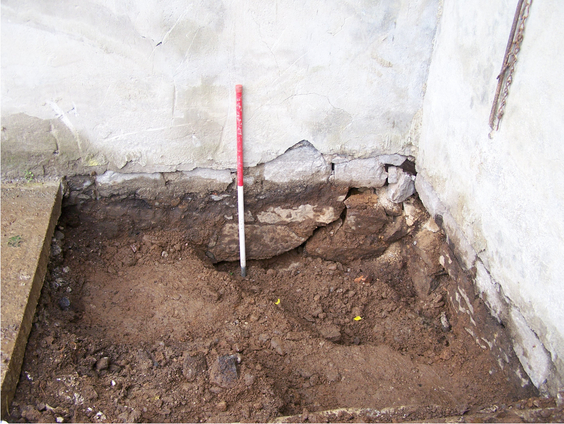
Plate One: Excavation of Test pit 1 in the southwestern corner of Market Yard. Base of the foundations are visible, looking south.