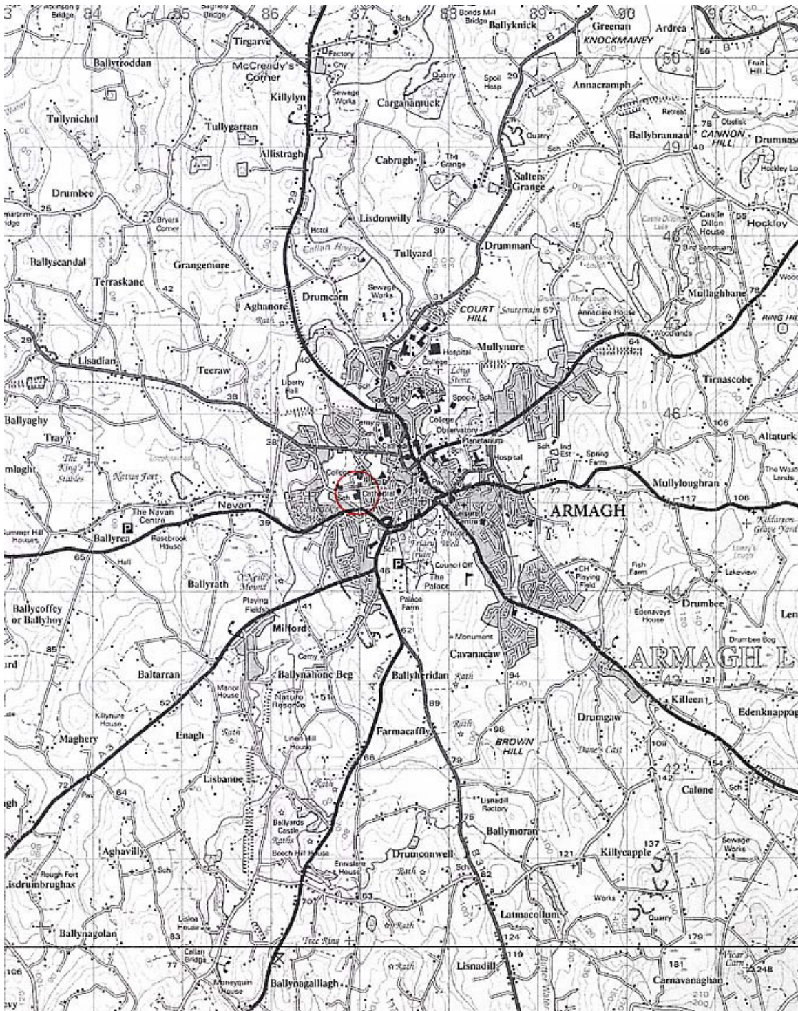
Figure 1: 1:50,000 map showing location of application site (circled in red).