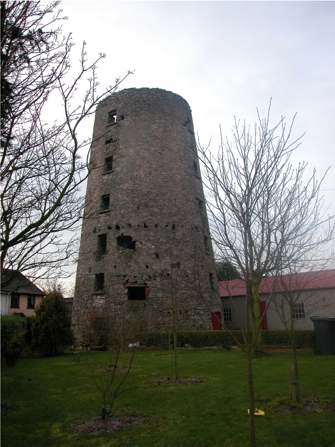
Plate 3: Windmill stump, looking south-west.