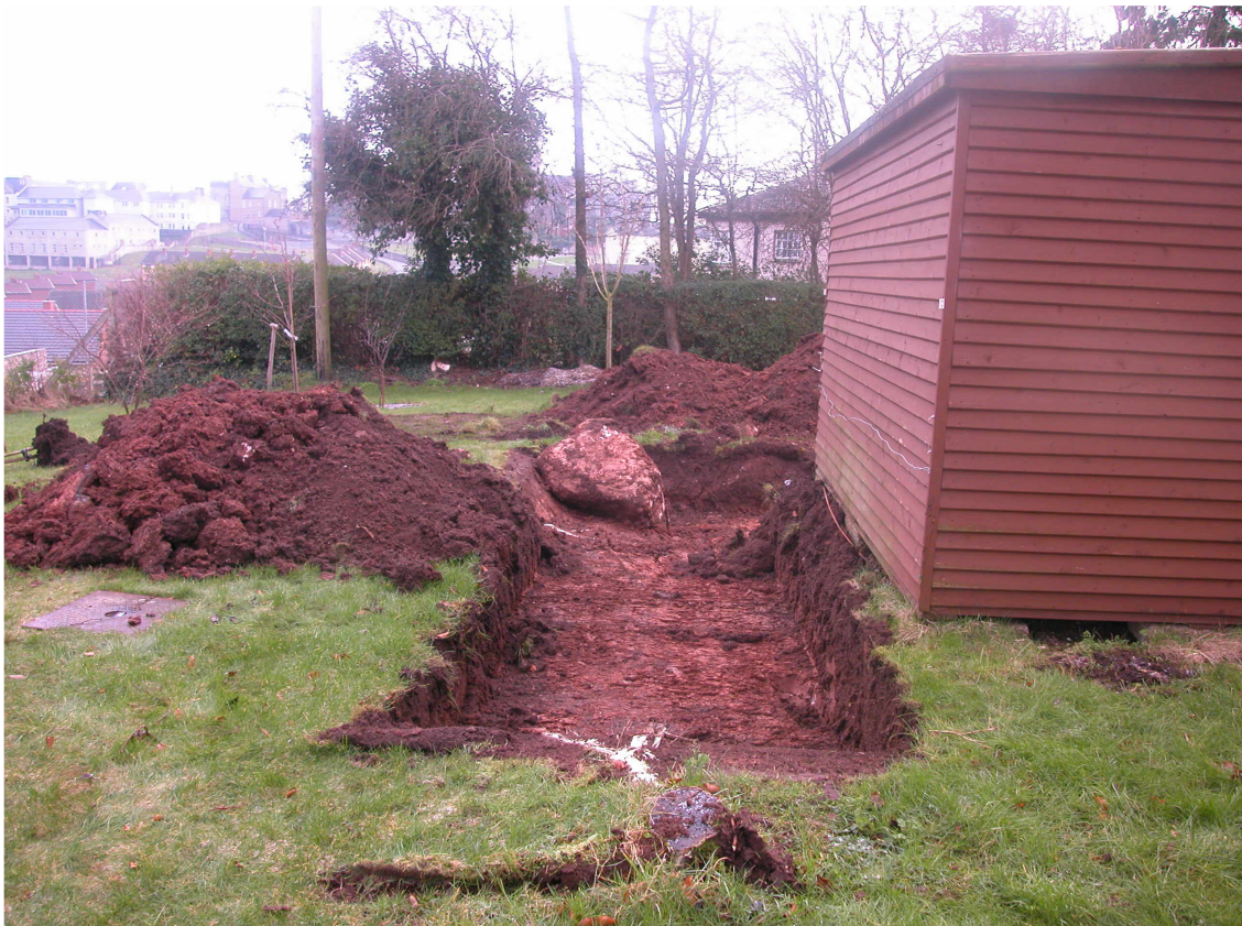
Plate 2: West to east leg of trench, looking east.