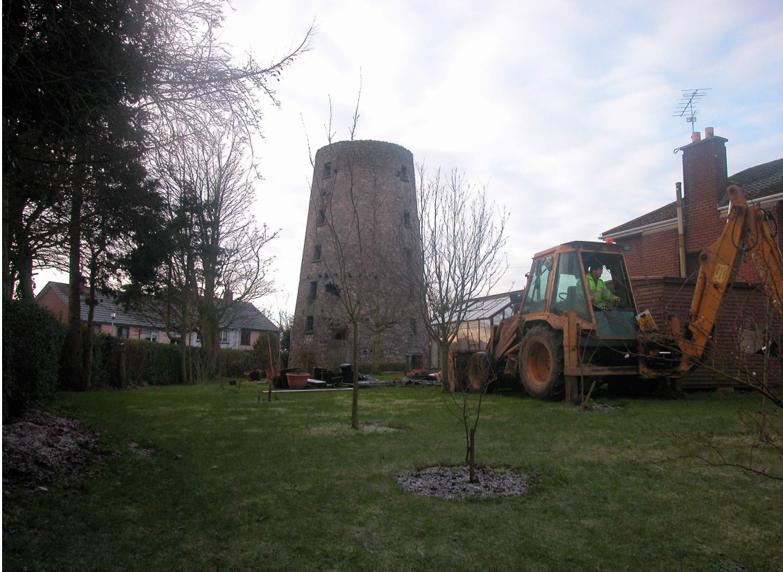
Plate 1: Application site with windmill stump, looking south-west.